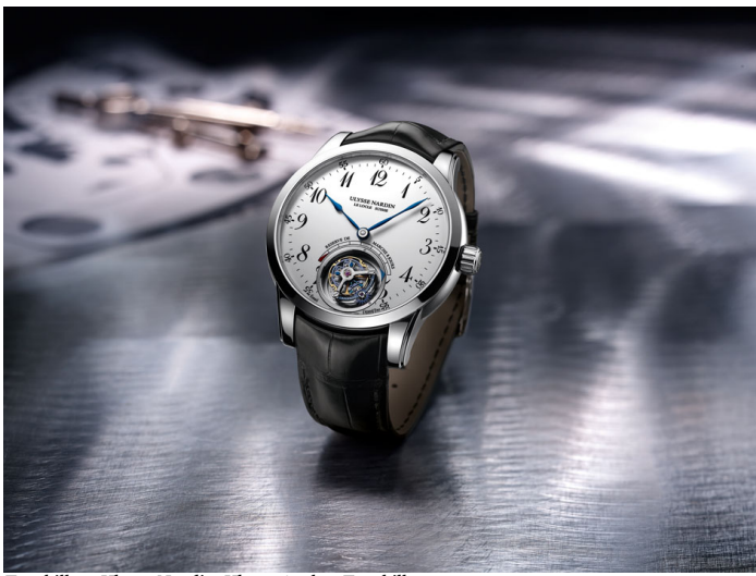
Tourbillon: Ulysse Nardin, Ulysse Anchor Tourbillon