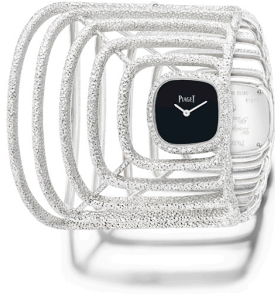
Revival Category: Piaget Manchette Diamond Cuff watch

Petite Aiguille: Affordable Watches (value and quality watches retailing for less than 8,000 Euro): Habring2 Felix