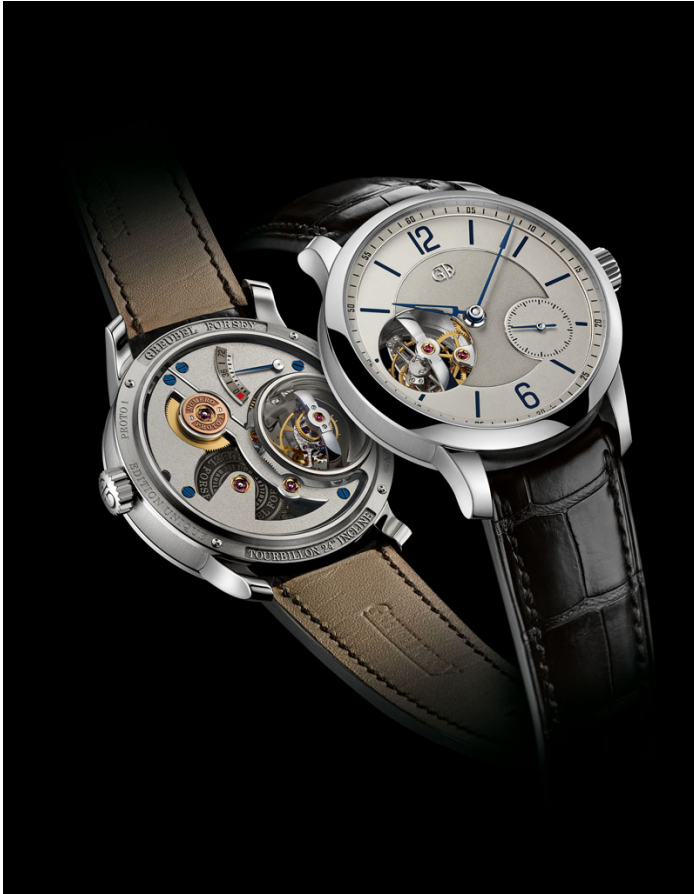
Aiguille D'Or Grand Prix: Greubel Forsey, Tourbillon 24 Secondes Vision