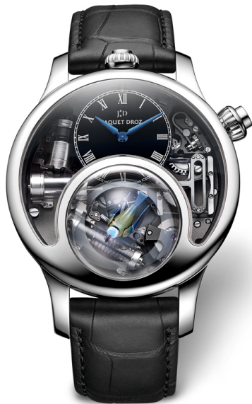
Mechanical Exception: Jaquet Droz Charming Bird