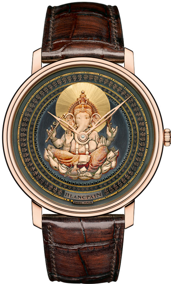
Artistic Category: Blancpain Villeret Cadran Shakudo