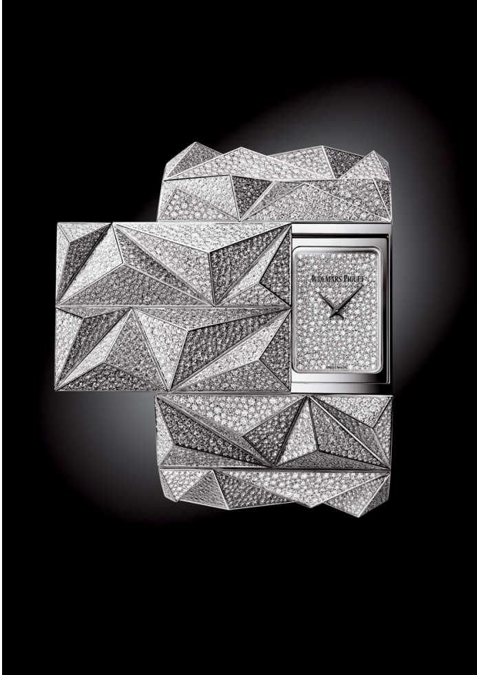
Jewelry: Audemars Piguet Diamond Punk

Ladies High Mechanicals: Faberge Peacock. The CEO of Faberge actually brought with him an historic bust of Faberge' to celebrate. He then went on to thank his remarkable team.