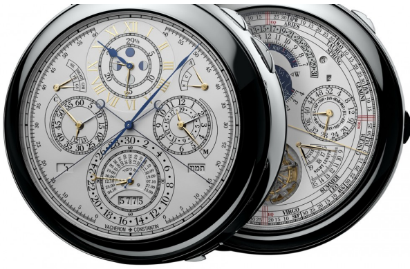
Vacheron Constantin Ref. 27260, the world's most complicated watch

This year, in fact, more than 200 watches were submitted for a spot in the final selection. A panel of judges then further narrowed that 200 to about 72 watches – of which just about 16 watches will win.