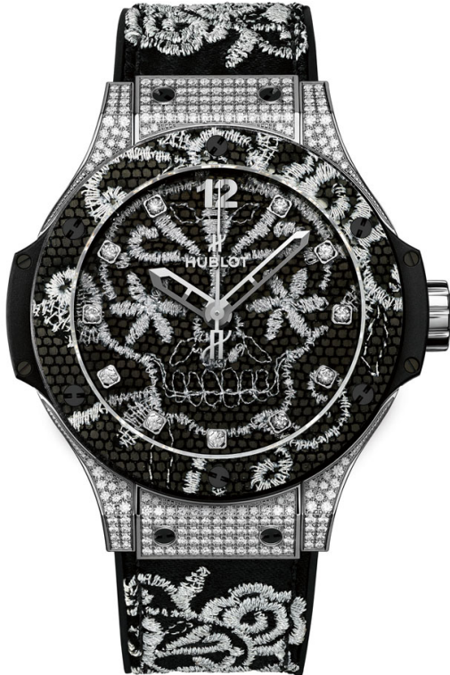
Ladies’ Category: Hublot Big Bang Broderie